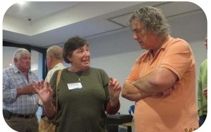
Deep in Conversation