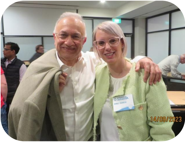
The Cool Doctor is Back - meeting newer members