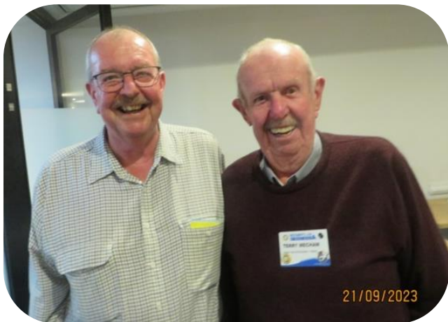
Taking a BBQ back seat