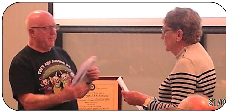
The Players in Action